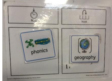
A child's transitional timetable