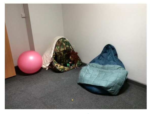
Acorn room allows a quiet reflection space