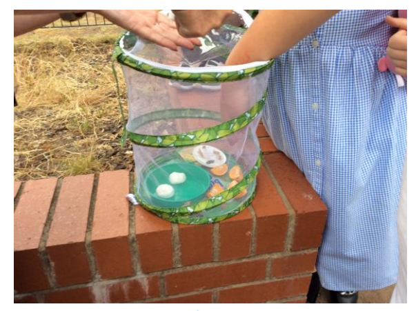
Releasing butterflies in Thrive