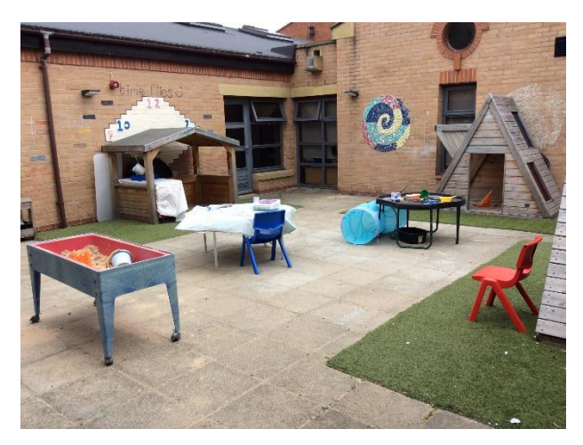
Multisensory activities are provided in the quad for Thrive sessions