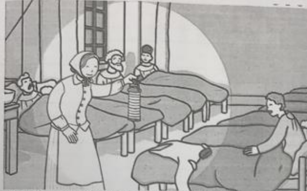
Look at the picture above. Explain what the problems were at the hospital and how Florence Nightingale solved them.

L.O. To develop an understanding of Florence Nightingale and the impact she had on nursing